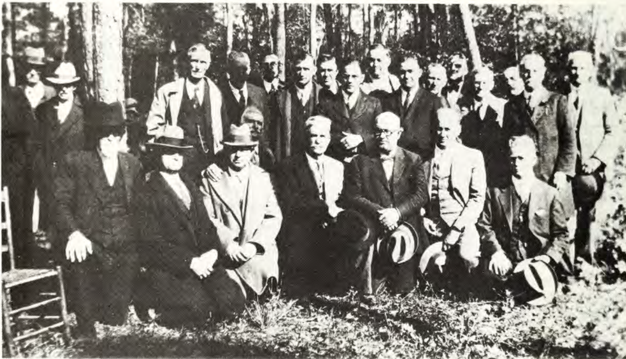
Ministers That Attended Mill Branch Association, Held With Tabor Church, Tabor City, North Carolina, Year of 1931