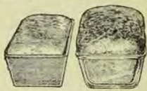
Baked in old-fashioned pan Baked in Pyrex Bakes bread an inch higher

These loaves were made from the same amount of dough and baked in the same sized pans in the same oven at the same time.