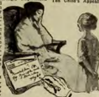
What Is Your Answer?