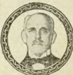
Hon. Leslie M. Shaw Former Secretary of the Treasury and Ex-Governor of Iowa.

Manufacturer's Note: Nuxated Iron is not a secret remedy, but one which is well known to druggists everywhere. Unlike the other iron-ore iron products, it is easily assimilated, does not irritate the bowels, make them black, nor upset the stomach. Nuxated Iron is not recommended for use in cases of acute illness, but only as a tonic, strength and blood builder. (In cases of illness always consult your family physician and be guided by his advice.) If in doubt as to whether or not you need a tonic, ask your doctor, as we do not wish to sell too much Nuxated Iron if you do not require it. If you should use it and it does not help you, notify us and we will return your money. It is sold by all druggists and general stores.