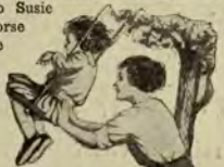
The Child's Appeal.

"Iron is absolutely necessary to enable your blood to change food into living tissue. Without it, no matter how much or what you eat, your food merely passes through you without doing you any good. You don't get the strength out of it, and as a consequence you become weak, pale and sickly looking, just like a plant trying to grow in a soil deficient in iron. If you are not strong or well, you owe it to yourself to make the following test: See how long you can walk or how far you can walk without becoming